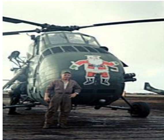
Christmas at Khe Sahn