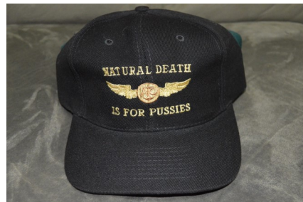
All Covers atr $15.00 they come in Black, Blue, and Green