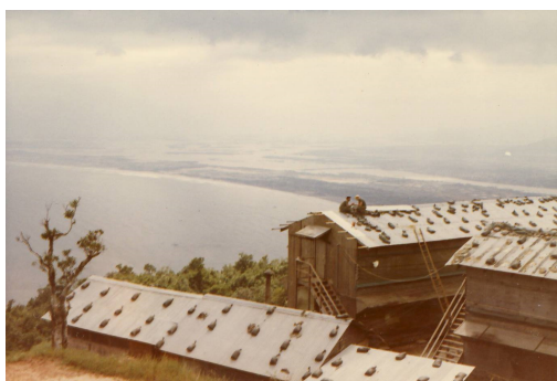
Bill White -MWHG-1 compound with Dogpatch over the wire, taken some-time during 1970.