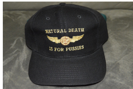
All Covers atr $15.00 they come in Black, Blue, and Green