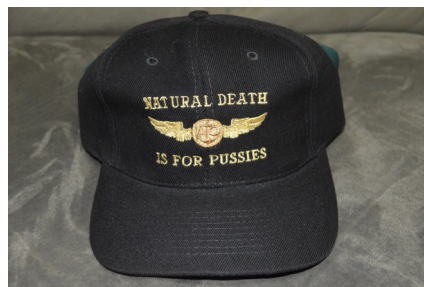
All Covers atr $15.00 they come in Black, Blue, and Green