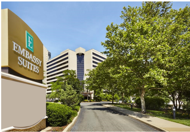
REUNION 2019 June 13-16 2019