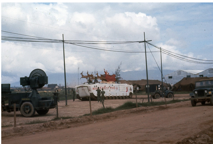
1965 Christmas spirit at the 3 rd MAF / 1 st MAW headquar-