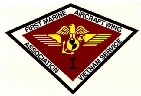
Two for $5.00 Contact Al Frater