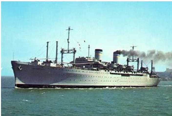
General D I Sultan, a WW II troop transport.