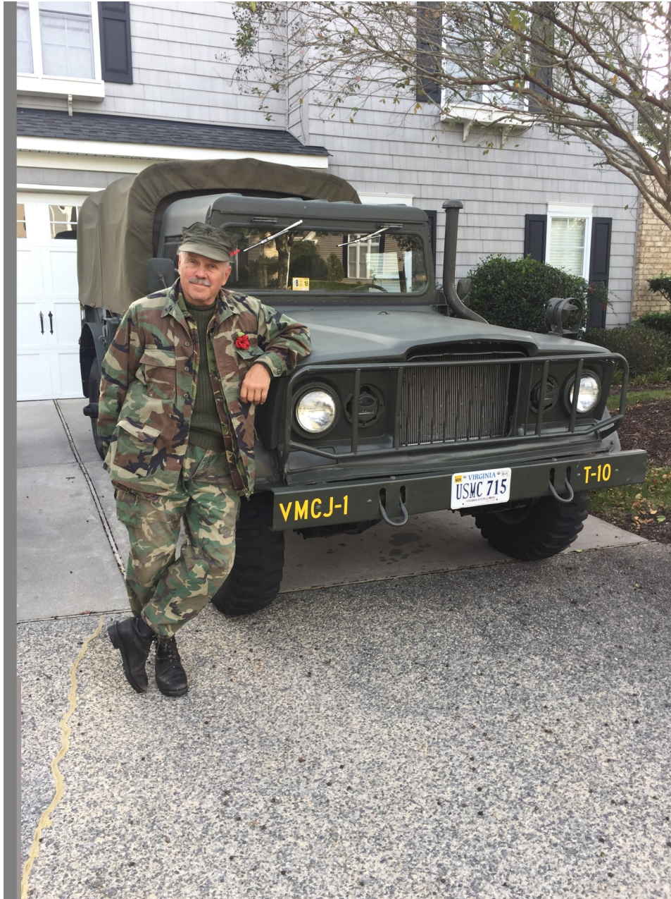
My truck and I from the Armistice day parade last year. It is a fully restored 1967 Kaiser Jeep M-715. I don't think we had any at DaNang then but it is the right year so when we had it done I had it badged for J-1