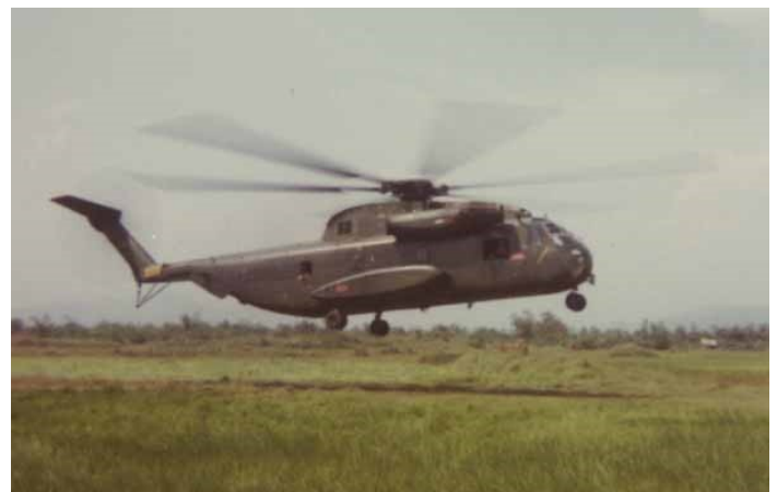
REUNION 2019 June 13-16 2019