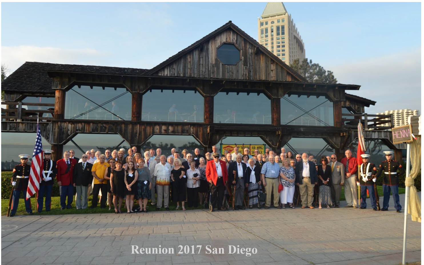
Reunion 2017 San Diego

First Marine Aircraft Wing Association – Vietnam Service 603 63 rd Ave W. Lot A-10, Bradenton, FL 34207