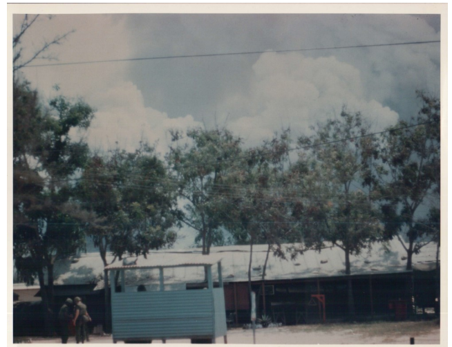
Ammo Dump Explosion DaNang April 27 1969