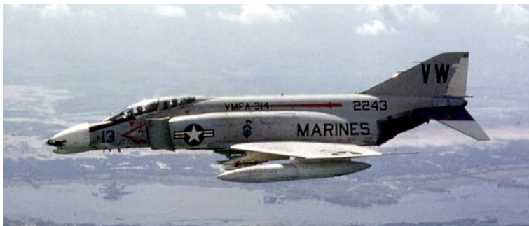
VMFA 314 in DANang 1968