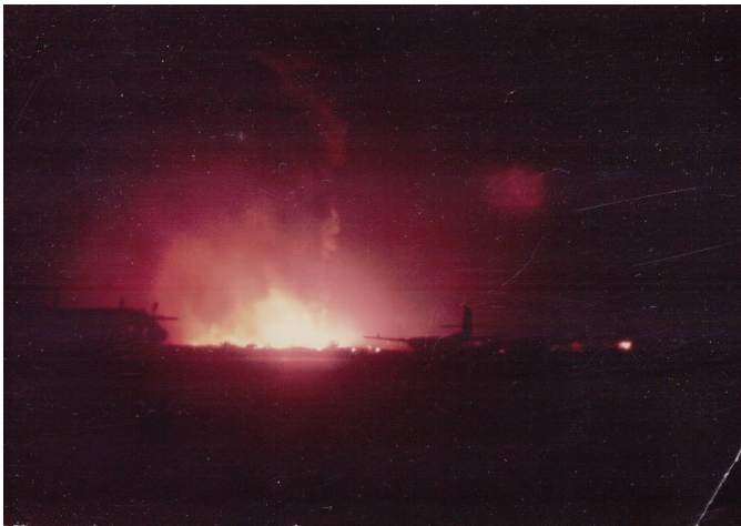
Rocket Explosion about 3:30 AM VMGR-152 - 1969 Taken from on top of Our Bunker with My 35 MM Patri Racer Camera , still have it .

Da Nang, South Vietnam, May, 1969: A huge ball of smoke and flames rises above Da Nang Air Base after a wind-swept grass fire ignited hundreds of tons of bombs at an ammunition dump. Two people were killed and 14 wounded in the series of explosions that continued for 14 hours after the initial blast. Overall damage to the base was light, however, and operations were not disrupted.