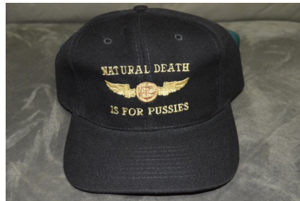
All Covers atr $15.00 they come in Black, Blue, and Green