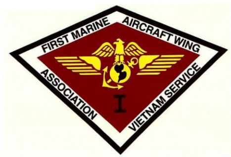
Two for $5.00

Al Frater 524 Sagamore Ave Teaneck NJ 07666