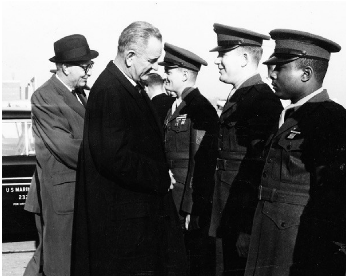
The attached photo is a very good example. The Marine corporal that LBJ was about to shake hand with when LBJ met with Marines at MCAS , Quantico, in 1963 was the with the Marine admin detachment in Saigon nearly two years later when I toured with and photographed Gen. Greene during his stop there in1964.