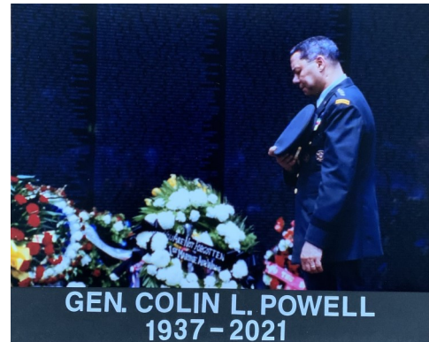
General Powell at our Reef