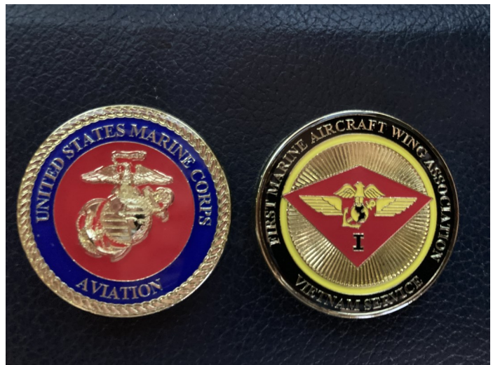
COINS are $10.00 plus $3.00 for shipping