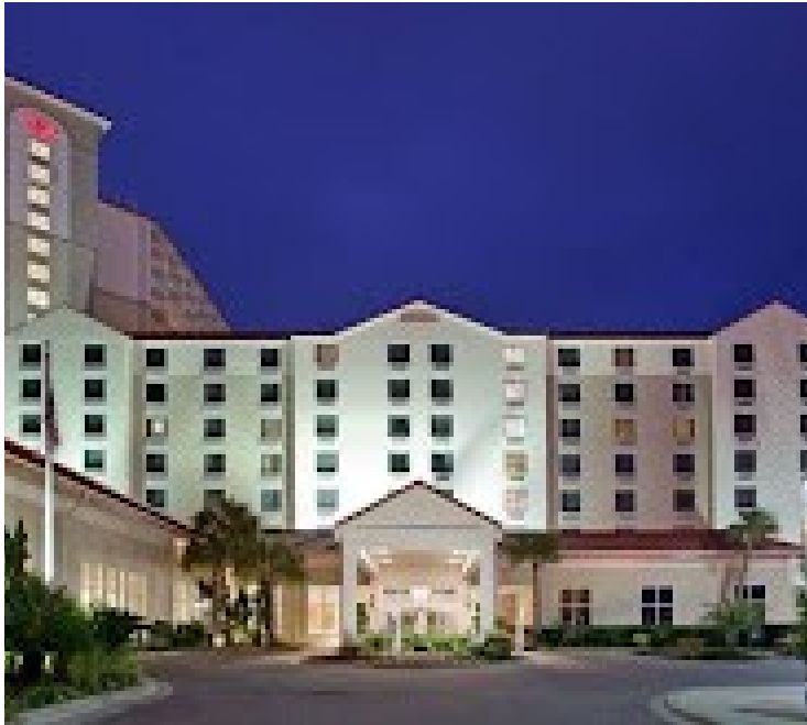
REUNION AT HILTON PENSACOLA BEACH