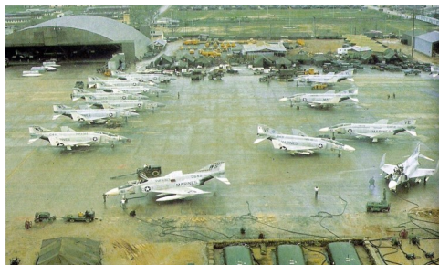
VMFA 323 in DA Nang