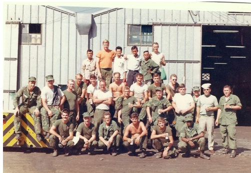
Christmas 1970 H&MS 11 GSE Da Nang