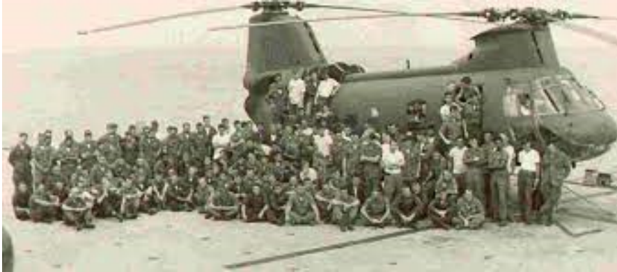
HMM 165 1968