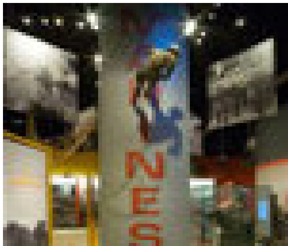
Making of Marines