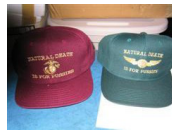
Natural Death hats $18