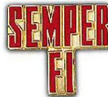
Semper Fi Pin $3.50