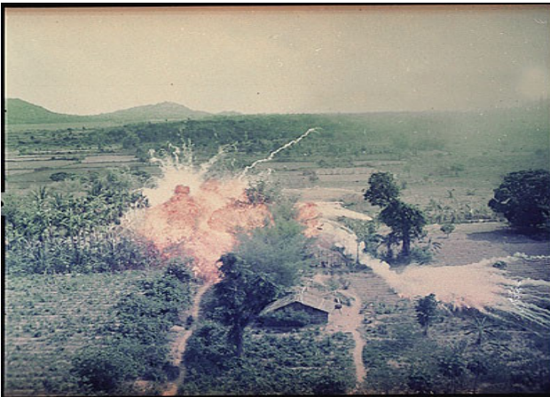
Napalm bombs explode on Viet Cong structures south of Saigon in the Republic of Vietnam. 1965