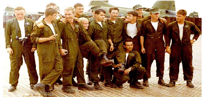
HMM165 Crew Chiefs 1969.