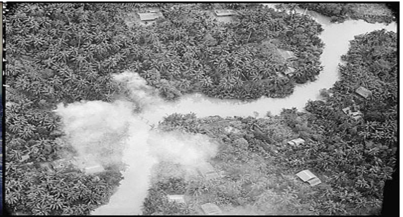
Bombing of Viet Cong structures along a canal in South Vietnam. 1965