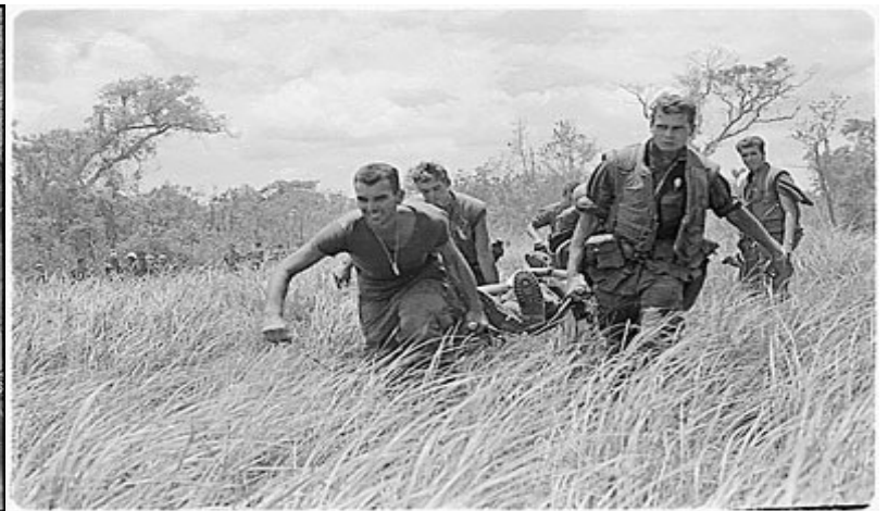
Vietnam. Medical Evacuation. Marines of Company E, 2nd Battalion, 9th Marines, while under heavy firefight with NVAs within the DMZ on Operation Hickory III, are carrying one of their fellow Marines to the H-34. 07/29/1967