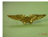
Navy Flight Off $7