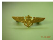
Pilot Pin $7