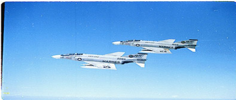
Vietnam. Two F-4b phantoms of VMFA-542, Marine Aircraft Group-11, 1st Marine Aircraft Wing, DaNang RVN, on their way to targets in support of Marines working in Northern I Corps. 01/1969