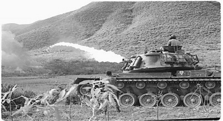
Vietnam. Marine Corps flame thrower tank