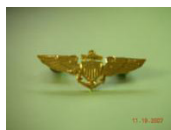
Pilot Pin $7