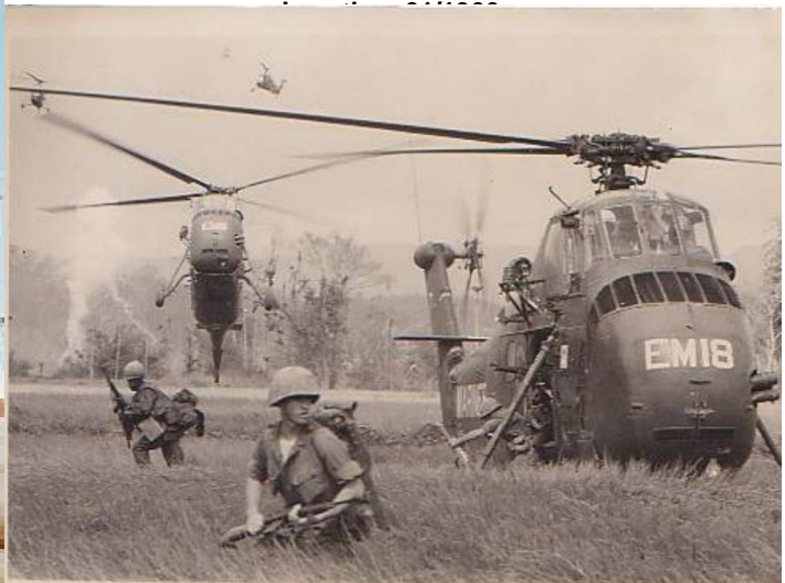
Marine Squadron HMM261 in 1965