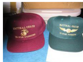
Natural Death hats $18