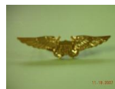
Navy Flight Off $7