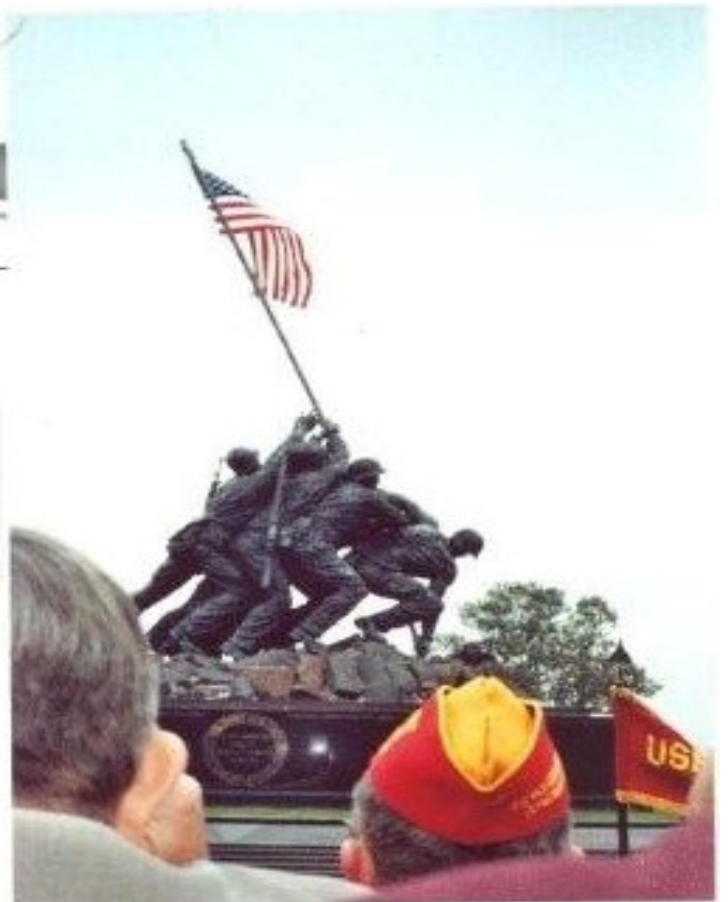
The Iwo Jima Memorial on the Marine Corps Birthday 2007