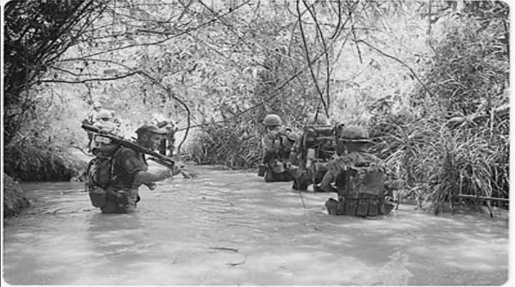
Dong Ha, Vietnam. Operation Hastings - Marines of Company H, 2nd Battalion, 4th Marine Regiment take to the water as they move to join up with other elements of their battalion. 07/1966