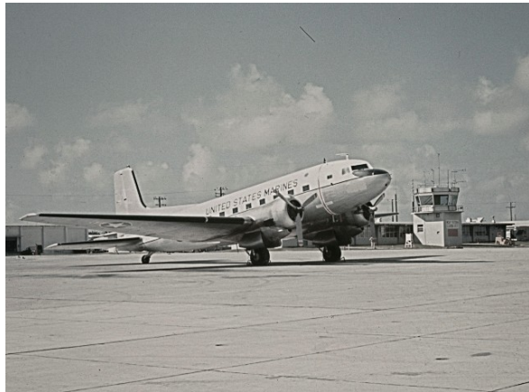
An R4-D transport and control tower on the flightline of MCAF, Futema, home of MAG-16