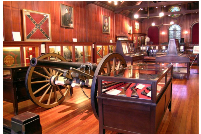
Civil War Museum