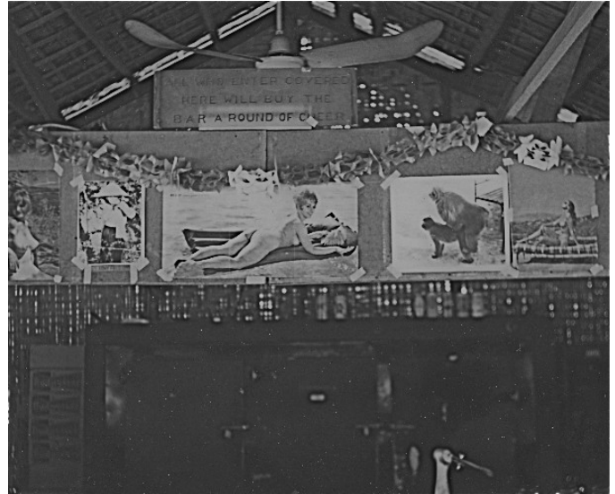
Several playboy centerfolds, a photo taken by a Marine on R &R of two fornicating primates at a Japanese zoo, and a photo of the "5 P girl" bearing her ample breasts constituted