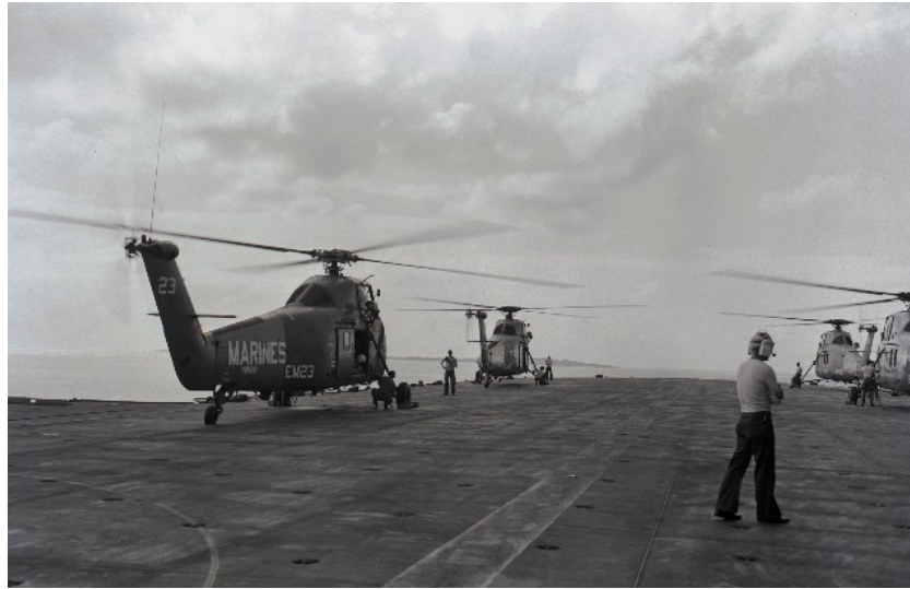
Four UH-34D helicopters from HMM-261 prepare to lift off the USS Iwo Jima flight deck bound for MCAF, Futema.