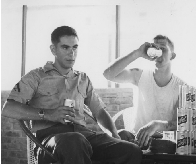
The author doing research for this story, along with a fellow SHUFLY Marine, the evening the EM Club opened in April 1963.

With beer costing only 10 cents a can as I recall, and popular hits playing on the club's busy Wurlitzer jukebox, the SHUFLY EM club was a pleasant place for Marines serving far from their home to pass the evening hours. It was primitive, but for many it was as cozy as their hometown pub.