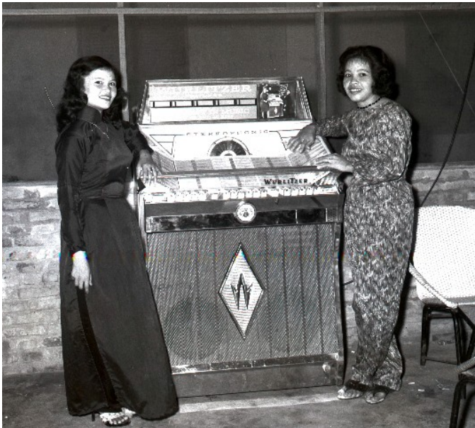
Two of the club's waitresses take a break from serving customers to pose beside the popular Wurlitzer jukebox.