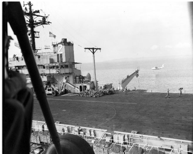
Aerial view of the USS Iwo Jima flight deck as HMM-261 Marines prepare for the brief flight to their new home, MCAF, Futema Okinawa following a 10 month deployment to Vietnam and Seventh Fleet.

In preparation for the transition, HMM-361 had been packing its equipment and readying its aircraft and Marines at Futema for the brief flight to the Valley Forge , also anchored off White Beach. Both squadrons were soon settled into their new homes and responsibilities