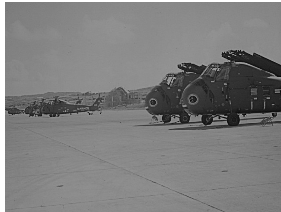
HMM-261 helicopters parked on the flightline of MCAF, Futema after returning from a 10 month deployment to Vietnam and service with the Seventh Fleet.